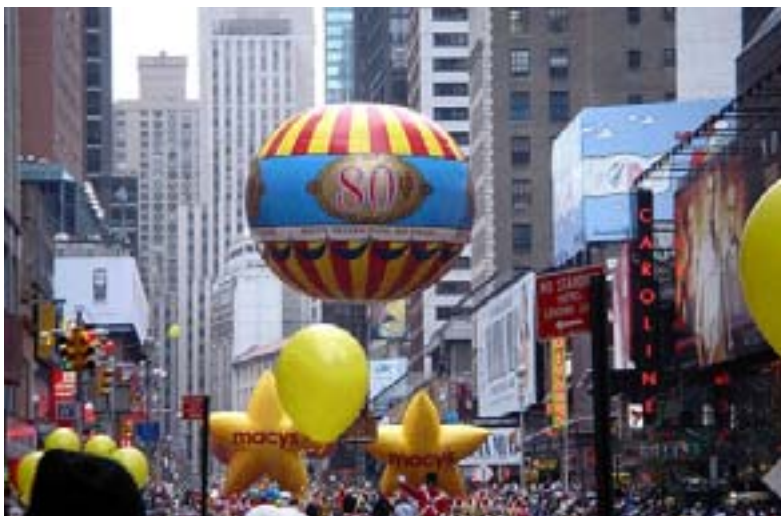
The first Macy's Thanksgiving Day Parade occurred in 1924, a tradition begun by Macy's employees. The 2006 Parade had some wet weather, but there was still a crowd to watch it.

All else the same, if the population in a region grows by 500,000, the model predicts an increase in the number of high-end department stores of 0.1735 (about a sixth of a store). If the population grows by a million, the expectation is a rise in high-end department stores of 0.347 (about a third of a store). If the population in a region thrives economically such that an additional half percent of households have over $150,000 in income, the model predicts an increase in the number of high-end department stores of 0.1781. This effect is of the same magnitude as that from a population rise of a half million and gives economic developers a feeling for the tradeoff between more people and wealthier people in