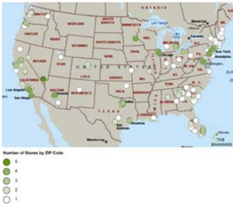
Figure 1. High-End Retail Department Store Locations

In our sample, population ranged from 57,813 for Enid, Oklahoma, to over 21 million for the New York – Northern New Jersey – Long Island, NY – NJ – CT – PA region. Figure 2 is a scatter plot of the number of stores against population for the 275 regions in the study. We see that the largest population centers have the largest number of stores. However, for smaller regions, the range on the number of high-end retail stores is broad, suggesting factors other than population also influence store location.