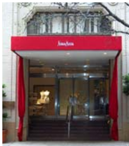
Neiman Marcus Flagship Store. In 1914, Neiman Marcus had a permanent location on Main Street at Ervay Street, in Dallas, which has had Texas landmark status since 1982.